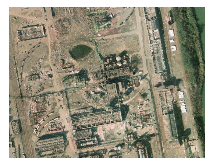
Figure 3: The area affected by the explosion

http://en.azf.fr/the-disaster/september-21-2001-800283.html [EMARS Accident # 403.]